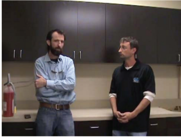
Video 5. Interview of a Local Professional.

The most common edit needed for live action films is to add some on-screen text to draw the viewer's attention to an important point being made. Animated power points often move too quickly and need to be adjusted for more time on a slide or need to add a voice component to be the tour guide to the text. An undergraduate research assistant provided with movie editing software can usually make the needed adjustments to a video.