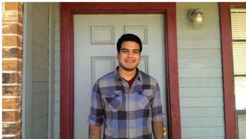
Video 6. Students' Mixed Scripted Acting with Power Point Slides.

The most common edit needed for live action films is to add some on-screen text to draw the viewer's attention to an important point being made. Animated power points often move too quickly and need to be adjusted for more time on a slide or need to add a voice component to be the tour guide to the text. An undergraduate research assistant provided with movie editing software can usually make the needed adjustments to a video.