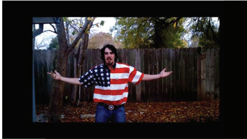
Video 7. Student's Friend Acting in their Video Project.