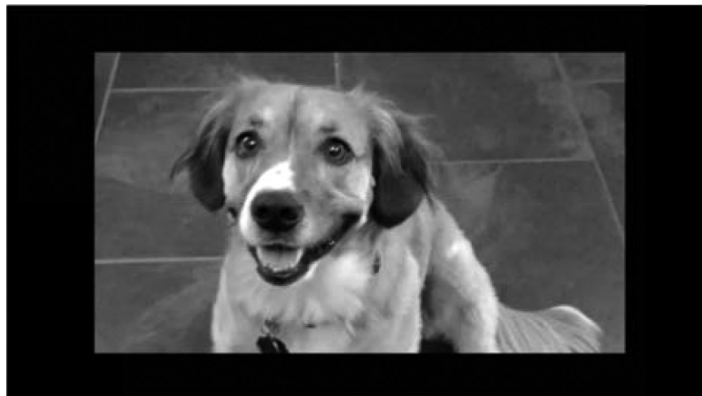
Video 8. Student's Dog Starring in their Silent Film Project.

Table 1 presents the mean pre- to post-video quiz scores and paired t-test results from four semesters of student projects debuted during this study. The topics listed were the subjects of the various student projects. While there is variation in performance improvement levels, nearly all topics showed an increase in quiz scores pre- to post-video presentations with an average improvement of 15.7%. Not all of these improvements were statistically significant, as shown in Table 1, with the about a quarter (7